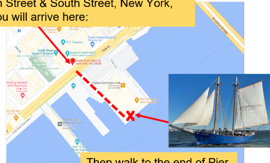
Then walk to the end of Pier 17 and "X" marks the spot.

If you Point your GPS or Google: "Fulton Street & South Street, New York, NY" you will arrive here: